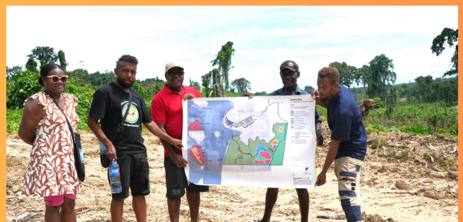
SINU team visited the Choiseul Province proposed development site