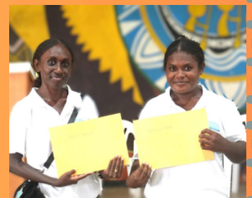
Two Business students celebrate their achievement as they proudly display their certificates.