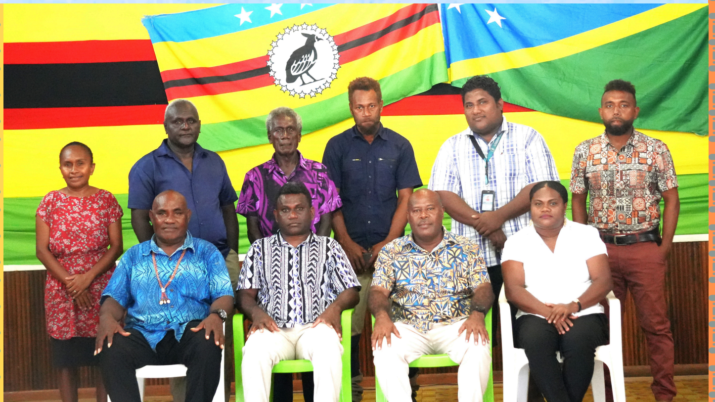
SINU consultation team and Choiseul Provincial Government team gathered for a group photo following a successful meeting in Taro, Choiseul Province.