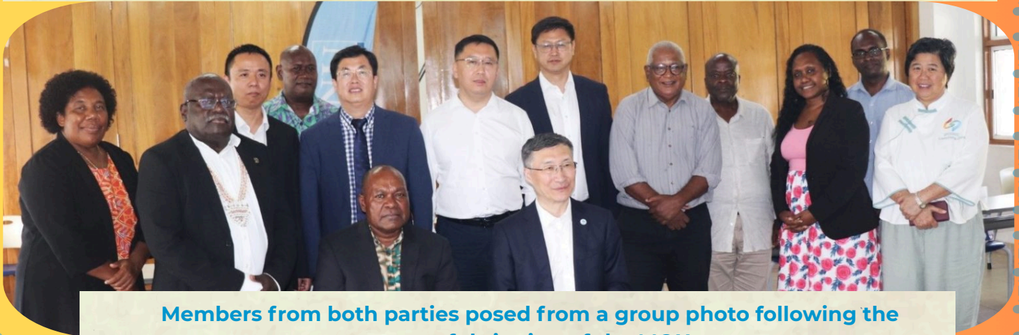
Members from both parties posed from a group photo following the successful signing of the MOU.

The Solomon Islands National University (SINU) and Ocean University of China (OUC) have officially launched the Solomon Islands–China Ocean Research Centre following the signing of a Memorandum of Understanding (MOU).