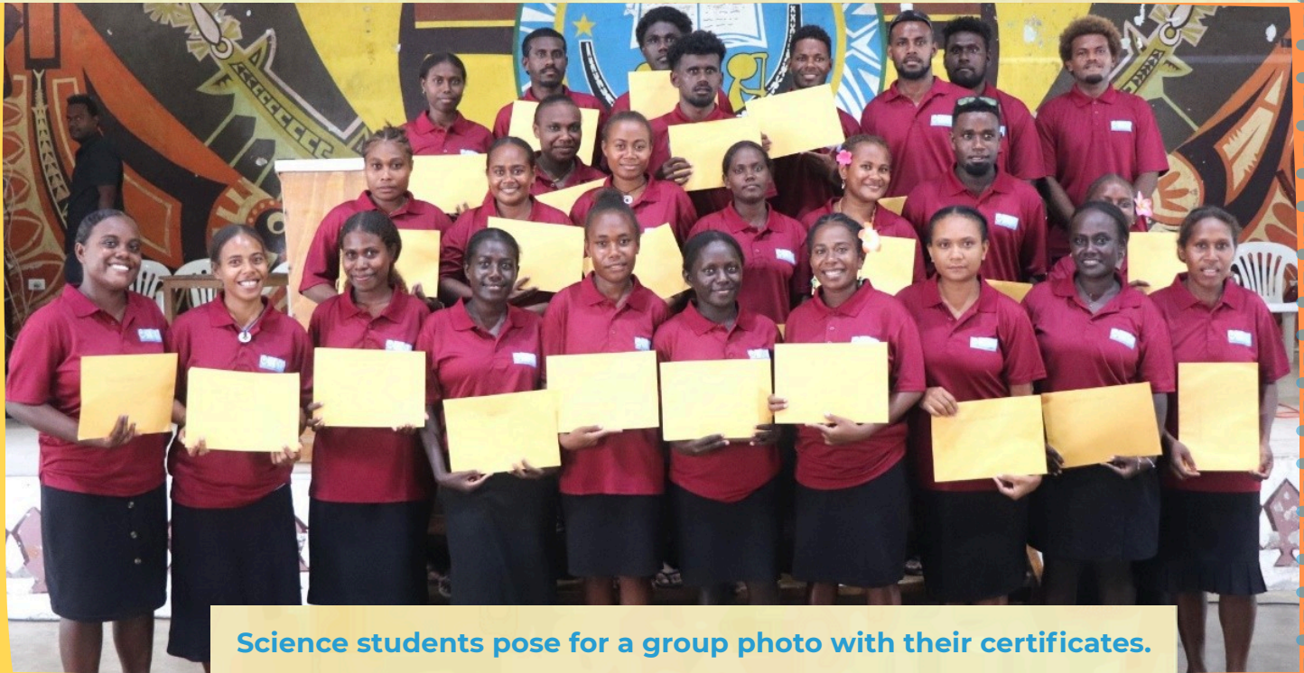
Science students pose for a group photo with their certificates.

He emphasized that the Solomon Islands' education system currently does not accommodate all students progressing to Form Six, and therefore the label "high school dropout" often reflects systemic inadequacies rather than an individual's potential, intelligence, or capability.