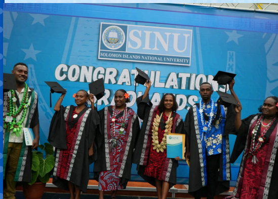
Some of the graduands pictured among the 105 students who successfully graduated from the Solomon Islands National University.

Of the 1,005 graduands, 632 are female, representing 63 per cent of the graduating class, while 373 are male, representing 37 per cent. The Vice Chancellor said this strong female representation was an encouraging sign for Solomon Islands and the wider region.