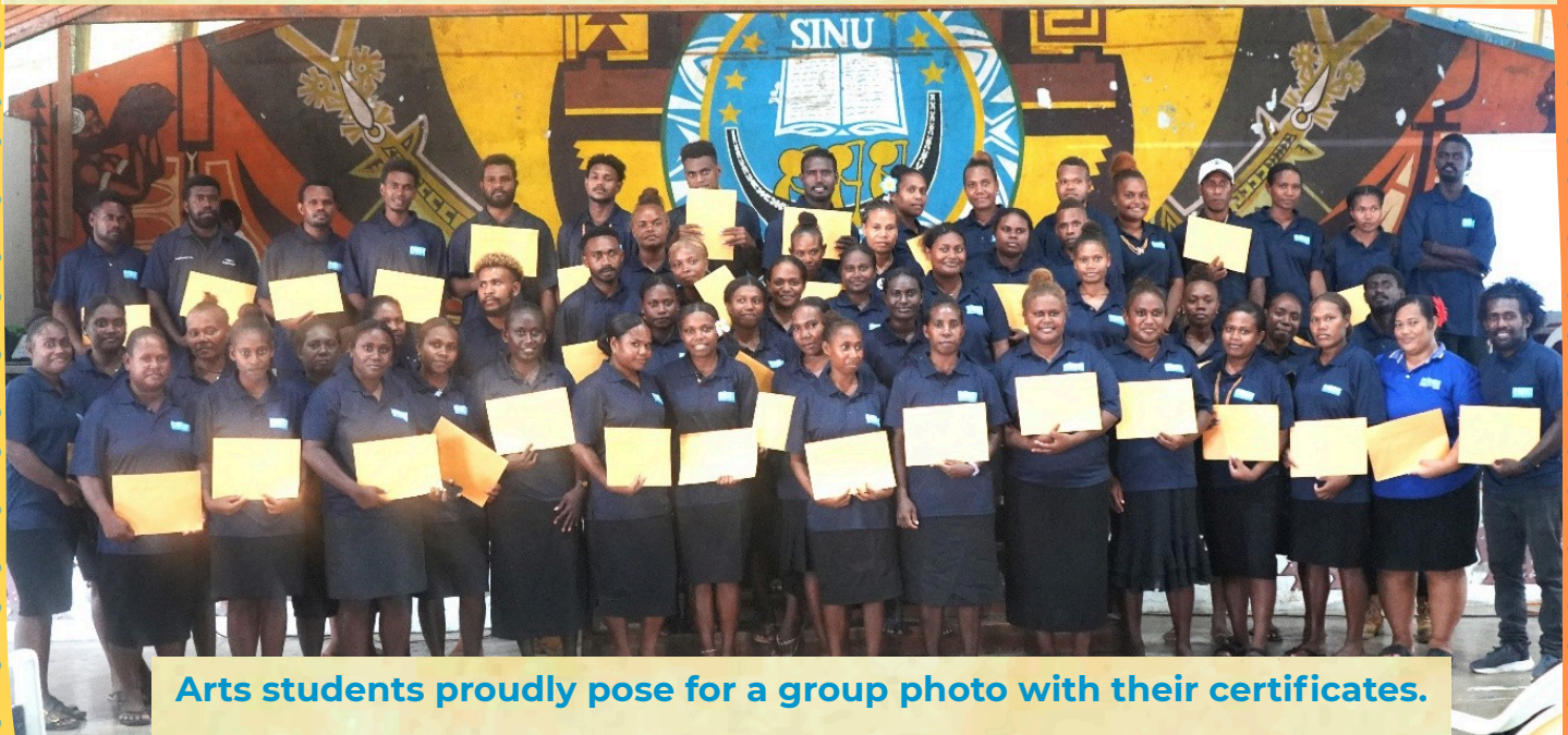
Arts students proudly pose for a group photo with their certificates.

The Solomon Islands National University (SINU) Centre for Distance and Flexible Learning (CDFL) marked a significant milestone on Thursday, 19 March, by awarding Certificates of Attainment to 100 students who successfully completed their pathway studies. The ceremony, held at the Pavilion on the Panatina Campus, was conducted under the theme: "Learn Anywhere, Grow Everywhere, Empower the Solomon Islands."