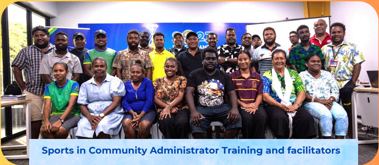
Sports in Community Administrator Training and facilitators

Staff from the Solomon Islands National University have benefited from a week long training on Coaching and Sports in Community Administrator Training under the Oceania Sports Education Programme (OSEP).