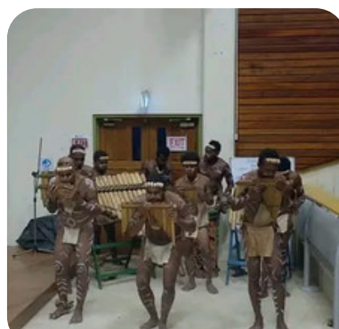
Wauraha Panpipers perform during the Native Lens Film Festival at SINU in 2024.

This partnership reflects SINU's commitment to cultural preservation while enriching the University's community activities through authentic Solomon Islands traditional music.