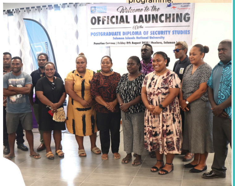
First group of students who undertake the Postgraduate Diploma in Security Studies pose for a group photo during the launching.