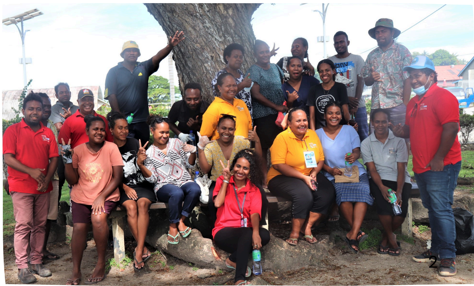
Picture below: SINU Staff posed for a group photo following a successful campus clean-up campaign back in 2023.