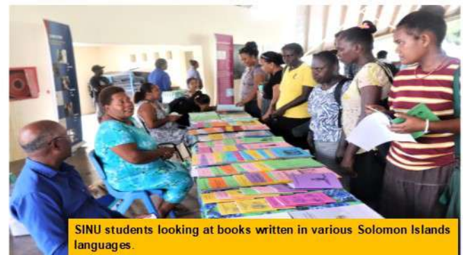
SINU students looking at books written in various Solomon Islands languages.

In honouring the commitment to the preservation and development of vernacular languages at SINU, the FEH Dean also announced a new partnership with Kulu Language Institute.