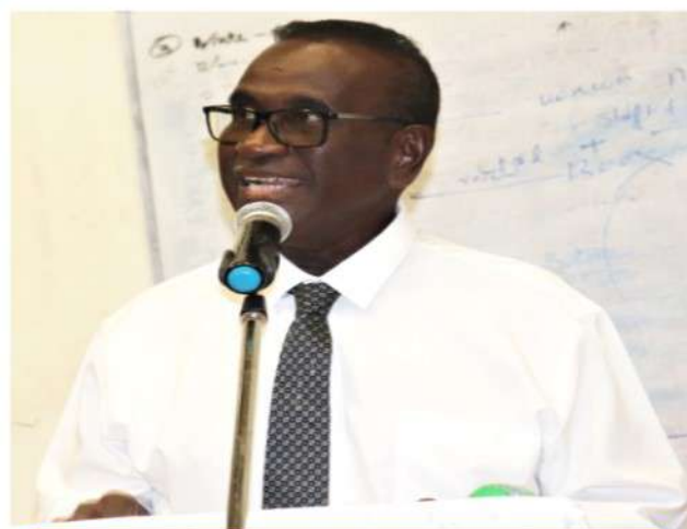
VC Prof. Transform Aqorau addressing students at the KLT.

al journey of SINU students and acknowledged the challenges they face.