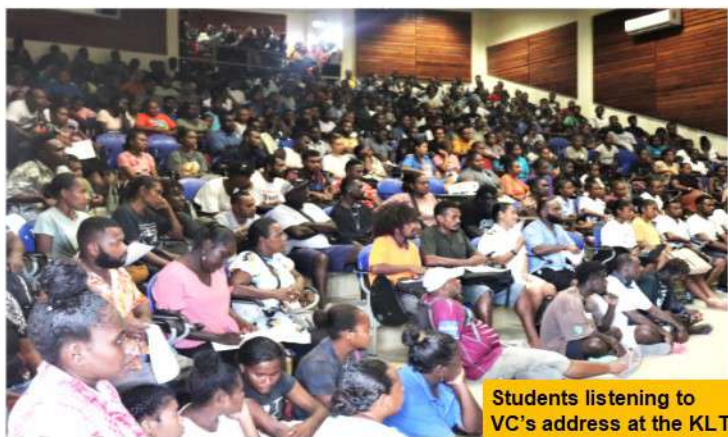
Students listening to VC's address at the KLT.

The VC on Tuesday 13 -02-2024 held a successful forum with SINU all-staff followed by the discussion with SINU students a day later.