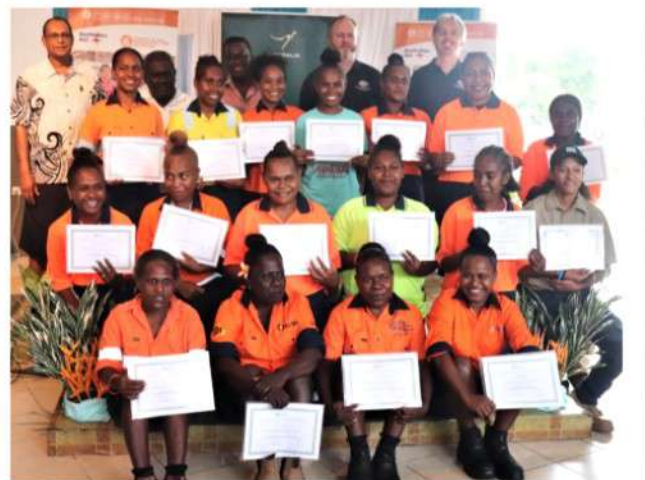
Participants of the Green Construction Training Program proudly displaying their certificates.

"By embracing clean energy, we can reduce our dependency on imported fuel, lower electricity costs, and unlock the immense potential of our rural economies. It is a pathway to self-sufficiency, sustainability, and resilience against the impacts of climate change."