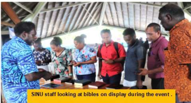
SINU staff looking at bibles on display during the event.

tapestry of languages that form the cornerstone of our cultural heritage and national identity in the Solomon Islands."