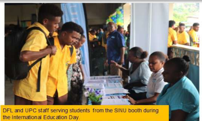
DFL and UPC staff serving students from the SINU booth during the International Education Day.