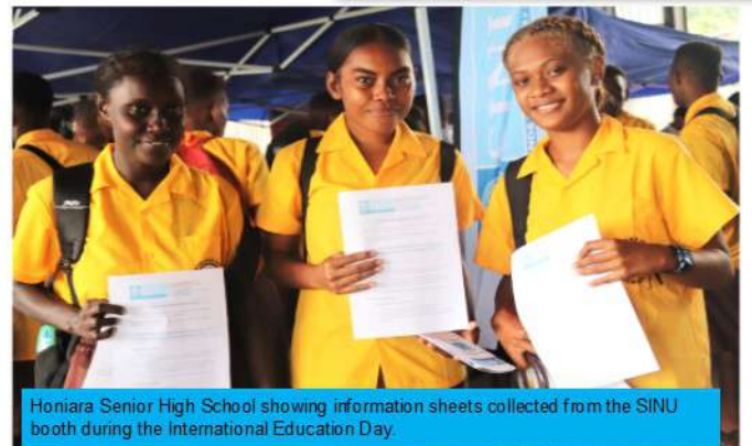
Honiara Senior High School showing information sheets collected from the SINU booth during the International Education Day.