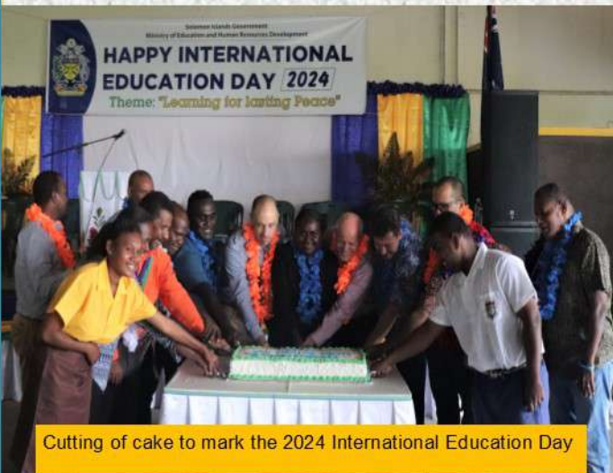
Cutting of cake to mark the 2024 International Education Day

Students also collected application forms from the SINU booth with the aim to apply and study at SINU after completing their secondary school.