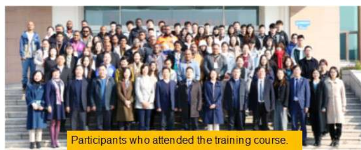
Participants who attended the training course.