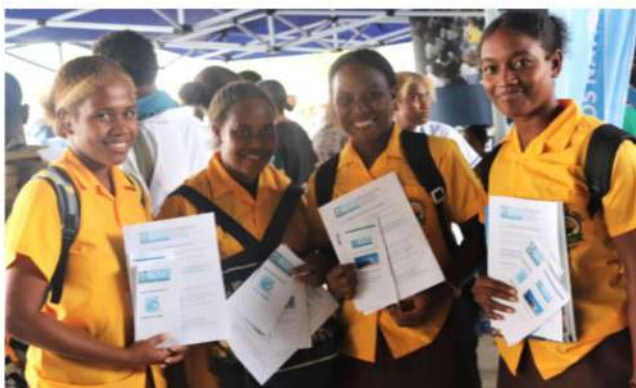
Students happy after learning about SINU and its programs.

following offices: Distance Flexible Learning (DFL), University Preparatory College (UPC), Marketing and Public Relation Office (MPRO) and Institutional Planning Division (IPD).