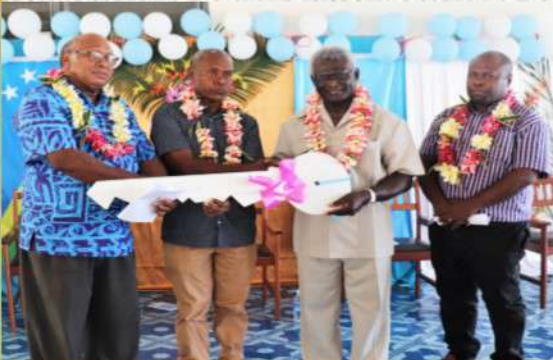
PM Sogavare hands over a dummy key to SINU representatives to symbolize the official hand over of the SINU dormitories from SIG to SINU.

He said apart from the $180 million used to fund the dormitory project, SINU also received an additional $64 million to upgrade existing facilities and classrooms adding SINU has received more than 200 million dollars' worth of project.