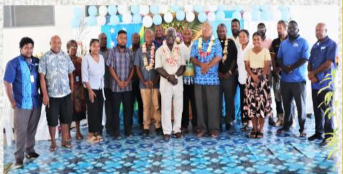
SINU staff posed for a group photo with PM Sogavare and members of his delegation during the hand over ceremony.

"It should also demonstrate to our development partners, more particularly the People's Republic of China and Solomon Islands Government's seriousness in investing in SINU."