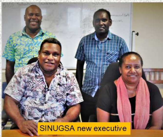
SINUGSA new executive

The landmark meeting underscores the commitment of the staff