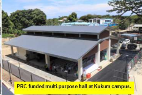
PRC funded multi-purpose hall at Kukum campus.