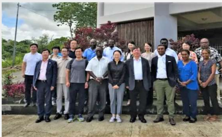
SINU staff and representatives from Oceans University of China and Qingdao Municipal Government posed for a group photo following a successful meeting at SINU on Wednesday 01-11-2023.

This partnership not only strengthens the academic repertoire of both institutions but also promises to yield enduring benefits for both nations and indeed, for the world at large."