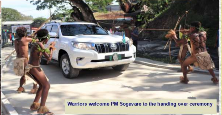
Warriors welcome PM Sogavare to the handing over ceremony