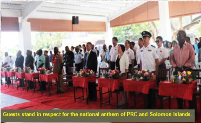
Guests stand in respect for the national anthem of PRC and Solomon Islands.