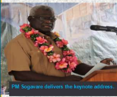
PM Sogavare delivers the keynote address.