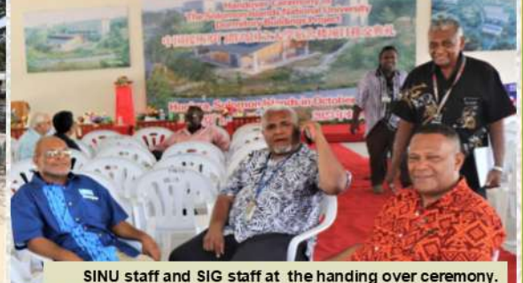
SINU staff and SIG staff at the handing over ceremony.