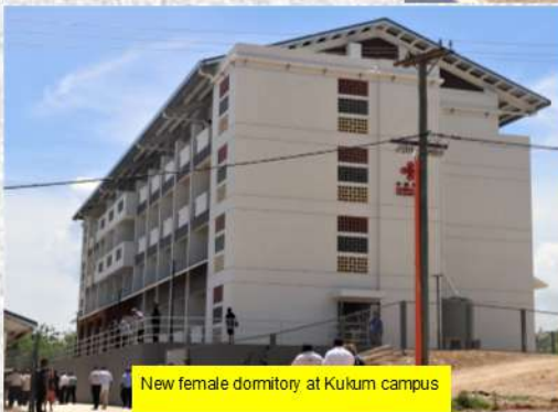
New female dormitory at Kukum campus