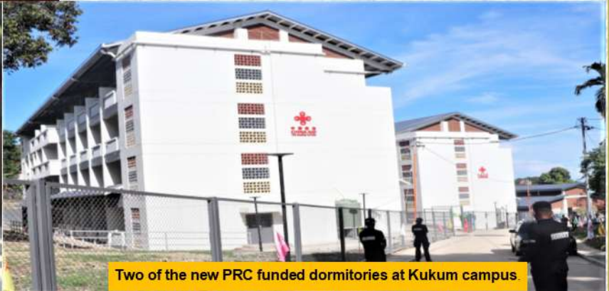
Two of the new PRC funded dormitories at Kukum campus.