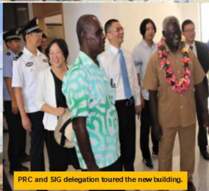
PRC and SIG delegation toured the new building.