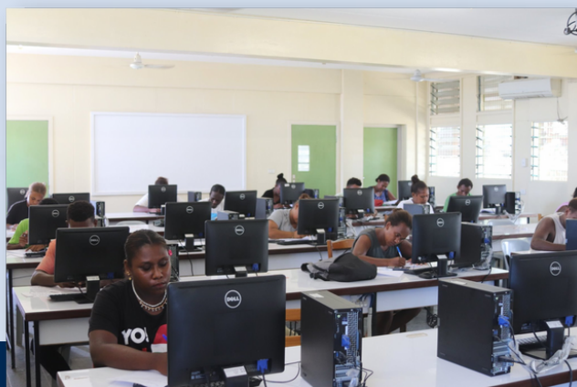
The Computing Science students developing the software algorithms in the practical lab (CSC501 unit).