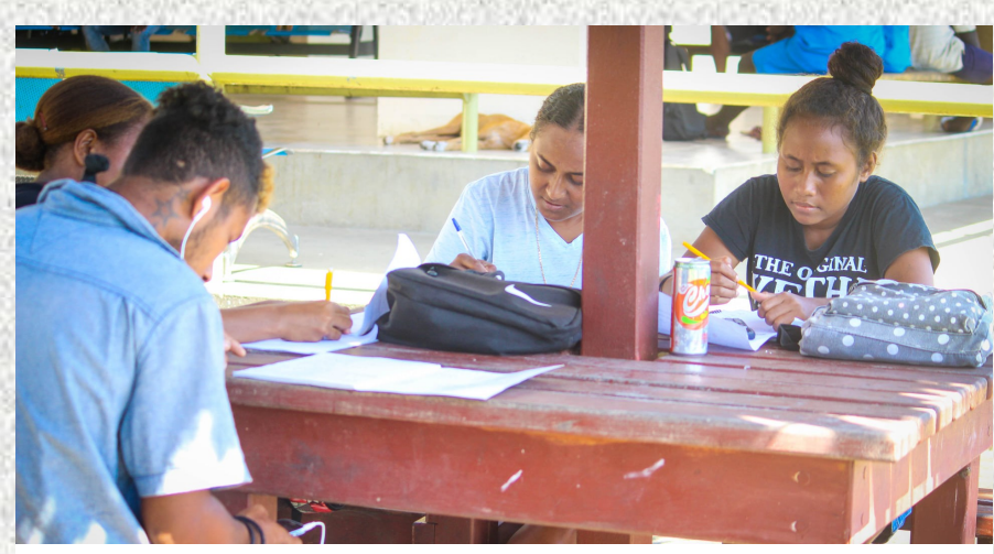
Students Studying.